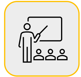
Strengthening & Supporting the Educator Workforce