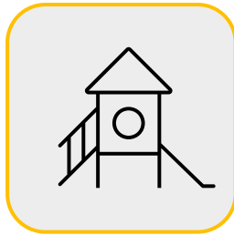
Early School Success