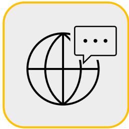
English Learners & Multilingualism

Content Centers are a type of Comprehensive Center designed to build the capacity of practitioners, education system leaders, public schools serving preschool through 12th grades (P-12) (which may include Head Start and community-based preschool), local educational agencies (LEAs), and State educational agencies (SEAs) to use evidence in the designated content area. Applicants must propose to operate a Content Center in one of the following areas: