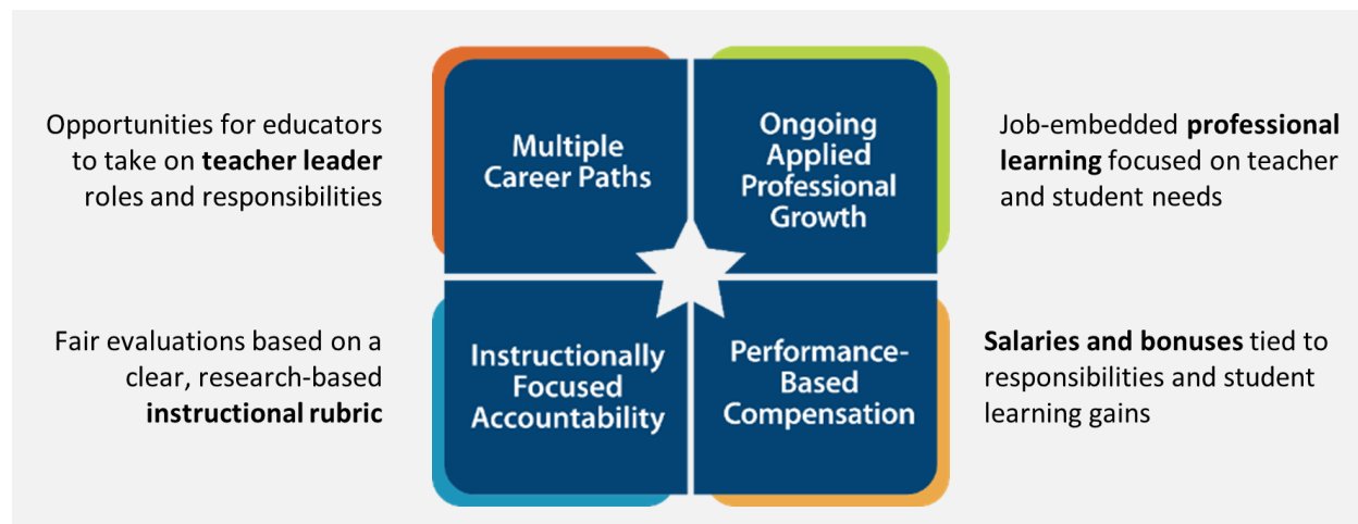
Figure 3. The Core Elements of the TAP System

Multiple Career Paths. There is a growing trend in schools to move away from traditional leadership structures and embrace an approach that involves collaboration between administrators and teacher leaders to drive instructional enhancements (Wenner & Campbell, 2017). Teacher leadership roles, such as the mentor and master teacher roles in the TAP System’s multiple career paths structure, enable effective teachers to utilize their expertise