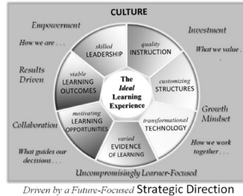
Designing a Performance Based Learning Community

The micro-credentials may be offered in a hybrid design using direct instruction and hosting on Empower, the districts’ online learning management system.