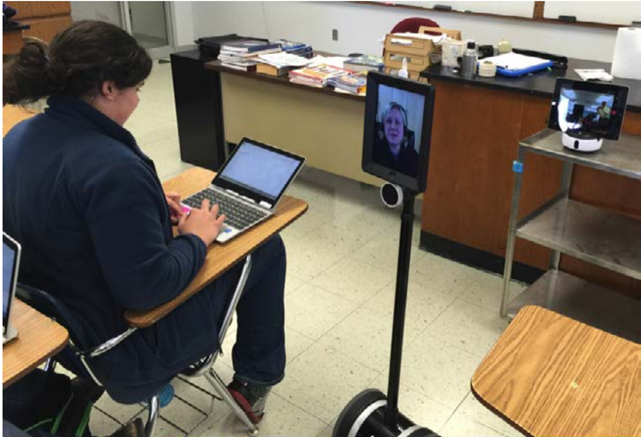
Figure 1. South Dakota Innovation Lab Hybrid Teaching Model