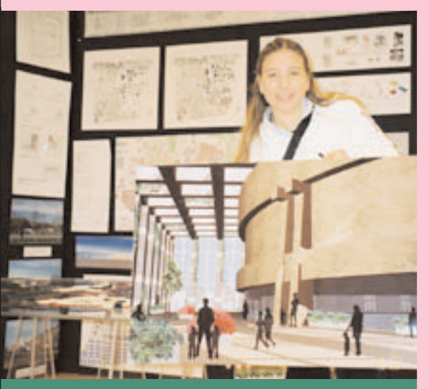
Extracurricular activities also include year book, international life, and fashion and talent shows.

This collaborative work ethic and practice gives students clear and consistent messages about what is expected of them and confirms their knowledge that they have support across the school. The president of the school's PTA said the "kids give us 100% because they know that we are there for them." A teacher said "we are involved in the kids' lives— we treat these kids like our own and they respond to us." Students interviewed appreciated the staff for setting high expectations and enforcing rules. "We know how much teachers care. They go the extra mile for us," one student said. Another noted, "the new principal helps a lot—he expects a lot of us."