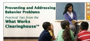
Tips for Behavior Problems