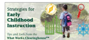
Tips for Early Childhood Instruction