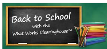
Tips for Back to School

Look for our topical features on strategies for teachers on our website. These releases focus on helping teachers access WWC material relevant to a time-sensitive or important topic.