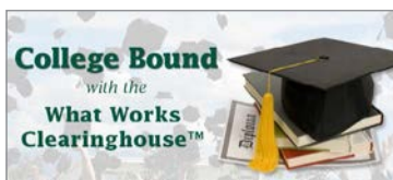
Tips for College Bound Students