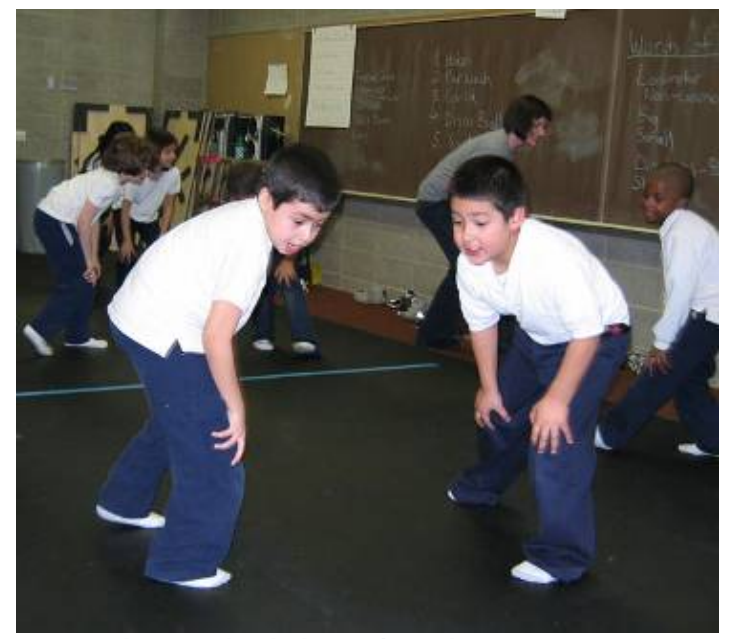
Dance classes also help students learn new vocabulary, such as locomotor.

A retired guidance counselor who was at Greeley for 34 years said, "We always had good kids and nice teachers. How you teach the kids in the beginning affects how they end up." Teachers agree that behavioral problems are rare, and their students are frequently complimented. "We don't have the discipline problems here," said a reading specialist. "We nurture them and have high expectations, and the kids know it." Staff members communicate those high expectations and increasing levels of responsibility "early and often." The former guidance counselor elaborates: Some schools think there's nothing you can do so they