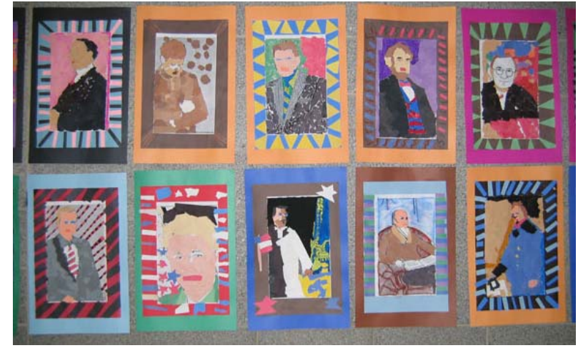
Student art work covers nearly all the available wall space.

Students in grades K-5 receive exposure to the four art disciplines: dance, drama, music, and the visual arts; those in grades 6-8 participate in a 30-week visual arts program with an artist in residence and also receive music instruction. The artist in residence program weaves arts learning with academic themes from social studies, history, and literature, each year focusing on a