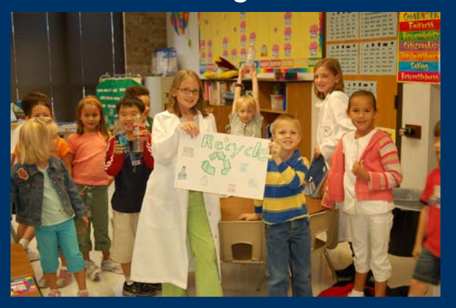
Students teaching in Classrooms