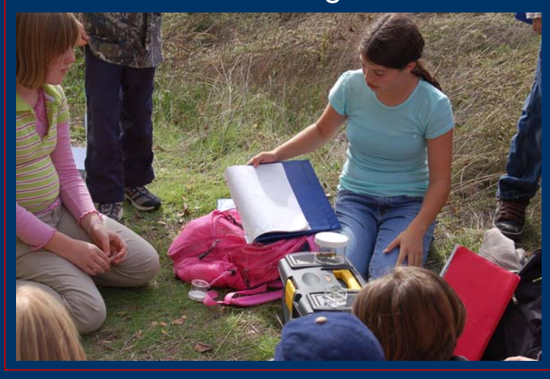
Students teaching students