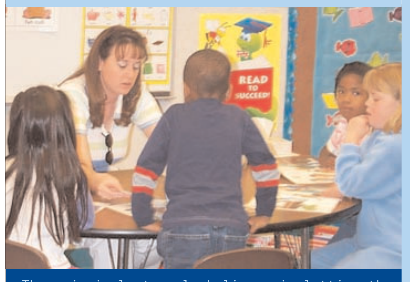
The principal strongly believes in letting the teachers do what they know how to do best.

Like the district superintendent's, the principal's philosophy emphasizes empowerment and professionalism. Convinced that most people go into teaching because they want to help kids, the principal maintains oversight but