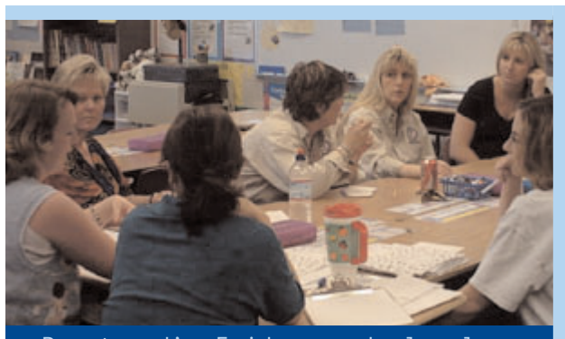
Brentwood's Friday grade level meetings were quickly recognized as invaluable and scheduled weekly.

and scheduled weekly. Teachers saw this planning time as key to the school's success; it encourages collaboration among teachers and instructional support staff and fosters planning, instruction, assessment, and support for each student. Grade level teachers meet on Friday afternoons to discuss students' needs, develop lessons, coordinate projects, generate ideas, review data, and strategize how to best meet individual students' needs. As a result, teachers are aware of activities in other classrooms and occasionally coordinate activities so that similar assignments are due on the same day.