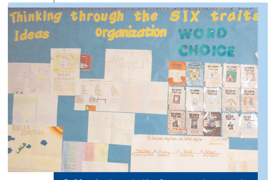
Bulletin board displays student work from the six traits writing model.

curriculum that features rigorous content, effective strategies, and monitoring systems. (Access curriculum guides through the district's website: http://www.vesd.org.) Brentwood teachers were heavily involved in developing the curriculum guides: a Brentwood teacher from each grade level participated in the district grade level councils.