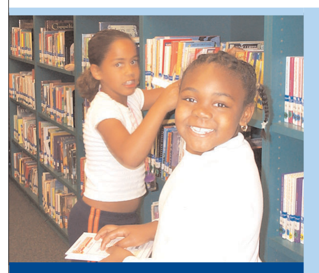
Brentwood's successful strategies include leveling and labeling all books in the school and classroom libraries.

As a result of their rigorous use of assessment data to determine individual students' needs, Brentwood teachers reported that students who enter a classroom below grade level in reading and math generally improve significantly by the end of