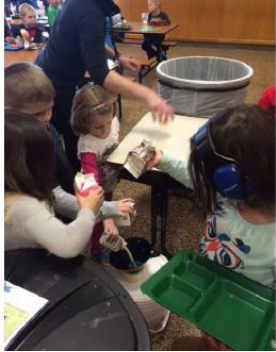
Students preparing to recycle milk cartons

reduction technology. In 2011, much of the school's "waste" went to the landfill, including discards from 50+ classrooms, offices, and large gathering spaces, as well as far too many unclaimed items in the "lost and found". Now there are zero-sort receptacles in every classroom, specialized programs for recycling electronics, ink cartridges, and markers, unclaimed clothing donations to a second-