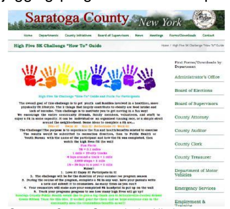
Saratoga County Spreads the Hi-5k Challenge Model

Since its inception the GRS Project has been supported by Hudson Crossing Park, a public educational and recreational destination within walking distance of the school. The annual Hudson Crossing Triathlon inspired a summer student and family jogging program called Towpath Tuesdays, as well as an annual