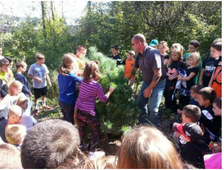
Planting a Peace Tree

an accessible symbol of peace for the entire student body, as it is a place that all visit for growing and learning and leading.