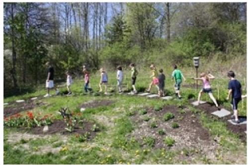
Students in the Butterfly Garden

appropriate release space for the newly-hatched butterflies. With the guidance and