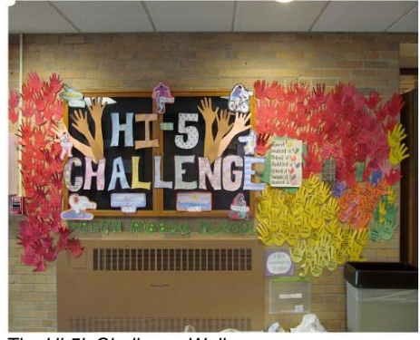
The Hi-5k Challenge Wall

Hi-5k Challenge, which invites participants to complete a 5k in some form- walking, jogging, racing, biking swimming, hiking, kayaking, etc. In the inaugural Hi-5k, more than 250 students,