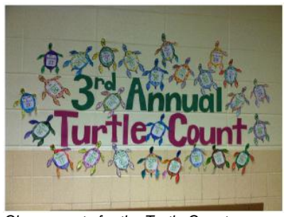
Class reports for the Turtle Count Challenge

A handful of projects exemplify the creativity, sustainability, and impact of this transformation of the school's vision, operations, and educational goals. Annually, more than 500 Schuylerville students,