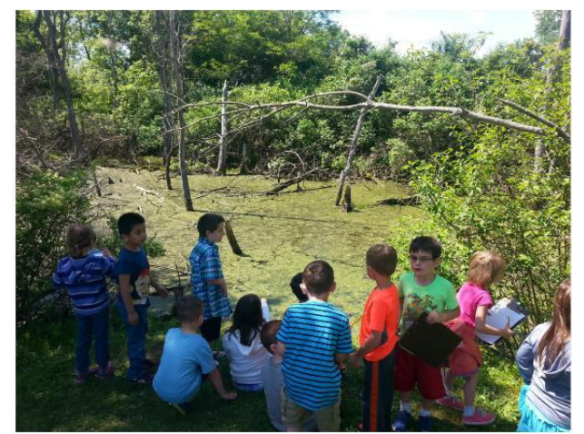
Counting turtles in the campus retention pond

it has garnered the attention of the Schuylerville Public Library, leading to collaboration with the GRS volunteers to plan a "Story Walk". Using the book "In the Small Small Pond", pages from the story will be posted on a trail around the school grounds, and then on waterside trails at Hudson Crossing Park, promoting outdoor observations and literacy to young readers.