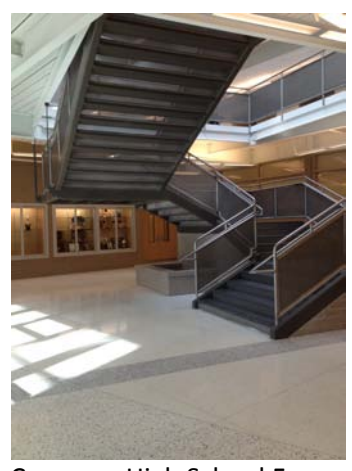
Cameron High School Foyer - LEED