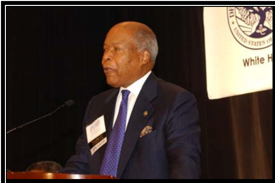
The Honorable Louis W. Sullivan, Chairman President's Board of Advisors on HBCUs