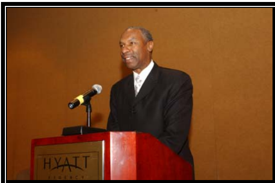
Rev. Dr. Floyd Flake President, Wilberforce University