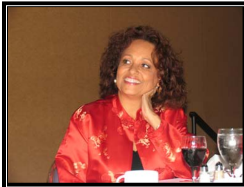
Mrs. Daphne Maxwell Reid, Actor