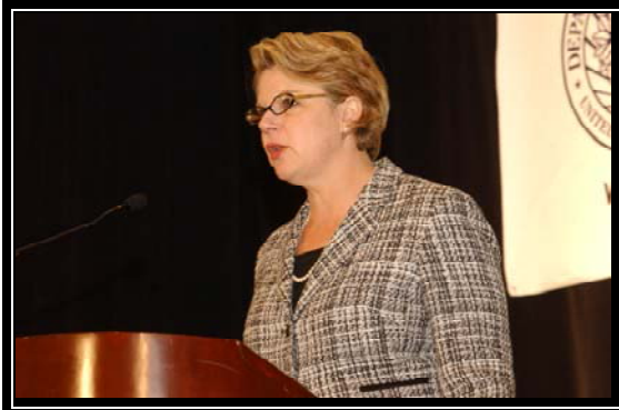
The Honorable Margaret Spellings U. S. Secretary of Education