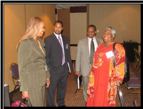
Title III Coordinators and U.S. Department of Education Officials