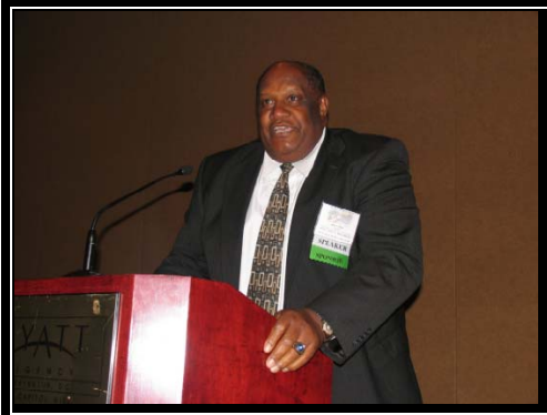
Mr. Willie D. Davis NFL Hall of Famer President, All Pro Broadcasting